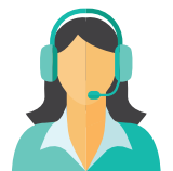
LIVE PHONE CALLS

Learn more about our services at www.piopac.com ▶